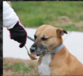
PB LICKING CONTEST

This will be an outside event, weather permitting.